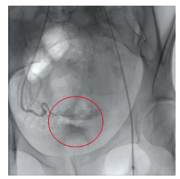
Figure 1. Arteriography of the right hypogastric artery, visualising the vanishing point