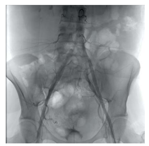
Figure 3. Control arteriography confirming cessation of vascular leakage

that arise in the immediate postoperative period following gynaecological surgery are limited [4, 5]. It is generally believed that the same techniques and general principles of embolisation are also applicable in such cases.